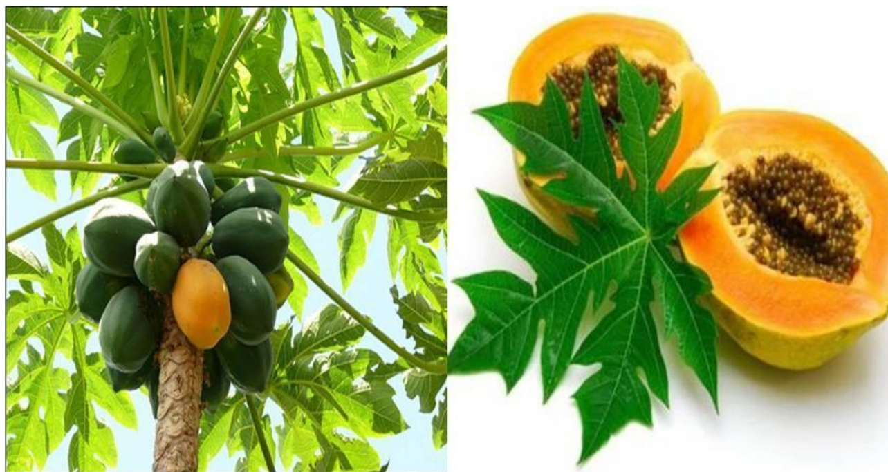
Figure 1. C. papaya plant and fruit with seed