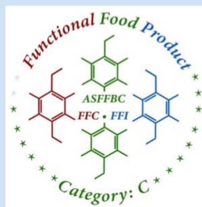
Logo for the certification of a Category C functional food product.

Copyright © 2023 by Functional Food Center Inc.