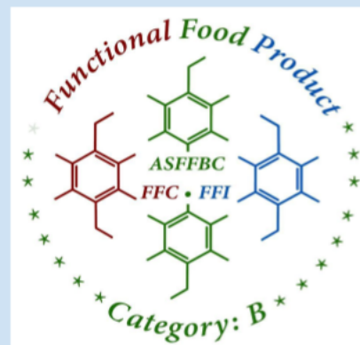
Logo for the certification of a Category B functional food product.

Copyright @ 2023 by Functional Food Center Inc.