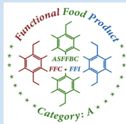
Logo for the certification of a Category A functional food product.

Copyright @ 2023 by Functional Food Center Inc.