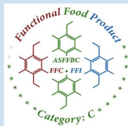
Logo for the certification of a Category C functional food product.

Copyright © 2023 by Functional Food Center Inc.