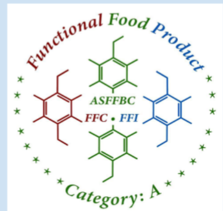
Logo for the certification of a Category A functional food product.

Copyright © 2023 by Functional Food Center Inc.