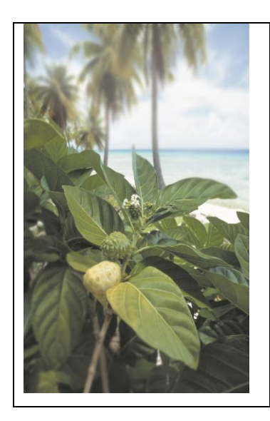
Figure 1. Tahitian noni tree on the beach.

Morinda citrifolia L. [noni] is a medicinal plant that has been used in folk remedies by Polynesians for over 2000 years [16-19]. It has been reported to have a broad range of therapeutic effects such as anti-oxidative, anti-inflammatory, antihistamine, antifungal, antibiotic, anticancer, and analgesic properties [20]. It has also been reported to have antithrombotic properties, but the mechanism remains unknown [21]. In previous studies, it was demonstrated that NJ made from Tahitian noni fruits by Morinda Holding Inc. is able to inhibit inflammatory reactions, scavenge reactive oxygen free radicals, quench lipid hydroperoxides, and inhibit Cox-1, Cox-2, and 5-LOX activities [22-26]. Figure 1 shows a Tahitian noni tree on the beach. This study examined the preventive effect of NJ and its additive and/or synergistic effect with heparin on jugular vein thrombosis induced by ferric chloride, as well as its possible mechanistic activities.