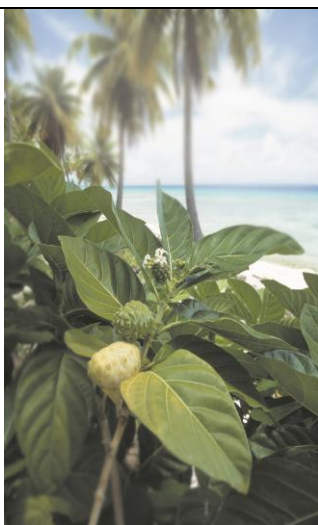
Figure 1. Tahitian noni tree on the beach.

Morinda citrifolia L. [noni] is a medicinal plant that has been used in folk remedies by Polynesians for over 2000 years [16-19]. It has been reported to have a broad range of therapeutic effects such as anti-oxidative, anti-inflammatory, antihistamine, antifungal, antibiotic, anticancer, and analgesic properties [20]. It has also been reported to have antithrombotic properties, but the mechanism remains unknown [21]. In previous studies, it was demonstrated that NJ made from Tahitian noni fruits by Morinda Holding Inc. is able to inhibit inflammatory reactions, scavenge reactive oxygen free radicals, quench lipid hydroperoxides, and inhibit Cox-1, Cox-2, and 5-LOX activities [22-26]. Figure 1 shows a Tahitian noni tree on the beach. This study examined the preventive effect of NJ and its additive and/or synergistic effect with heparin on jugular vein thrombosis induced by ferric chloride, as well as its possible mechanistic activities.